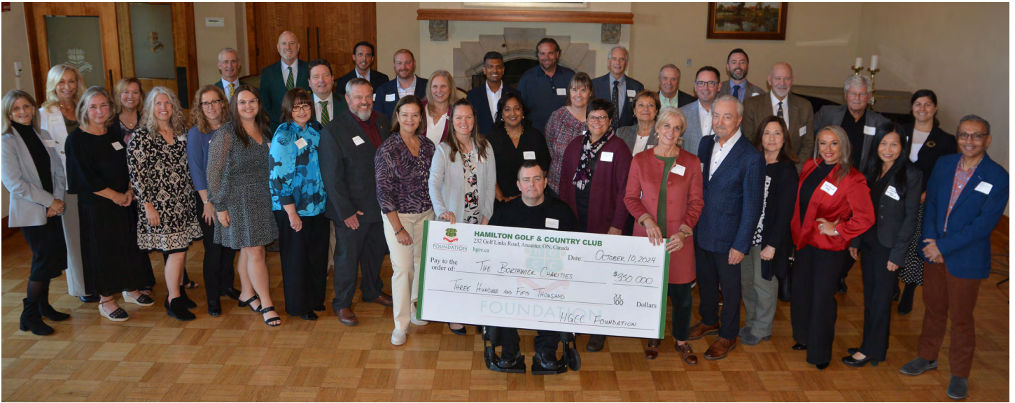
Lots of smiles from those who attended the HGCC Foundation cheque presentation ceremony earlier this month with charity partners receiving their $$$$!

Heartfelt words of thanks, compassion, generosity and hope echoed through the Great Hall earlier this month as the HGCC Foundation distributed cheques totalling $350,000 to nine local charities and community organizations.